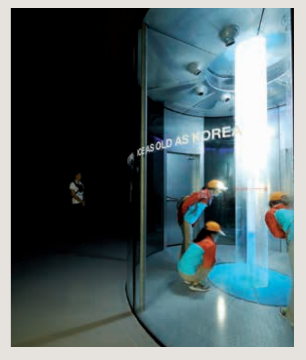
Expo 2012 Yeosu