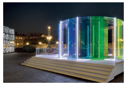
350 Years Saint-Gobain, worldwide roadshow