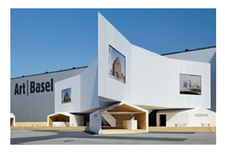
Schaulager Satellite, Art Basel