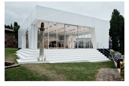
Škoda Superb presentation, Siena