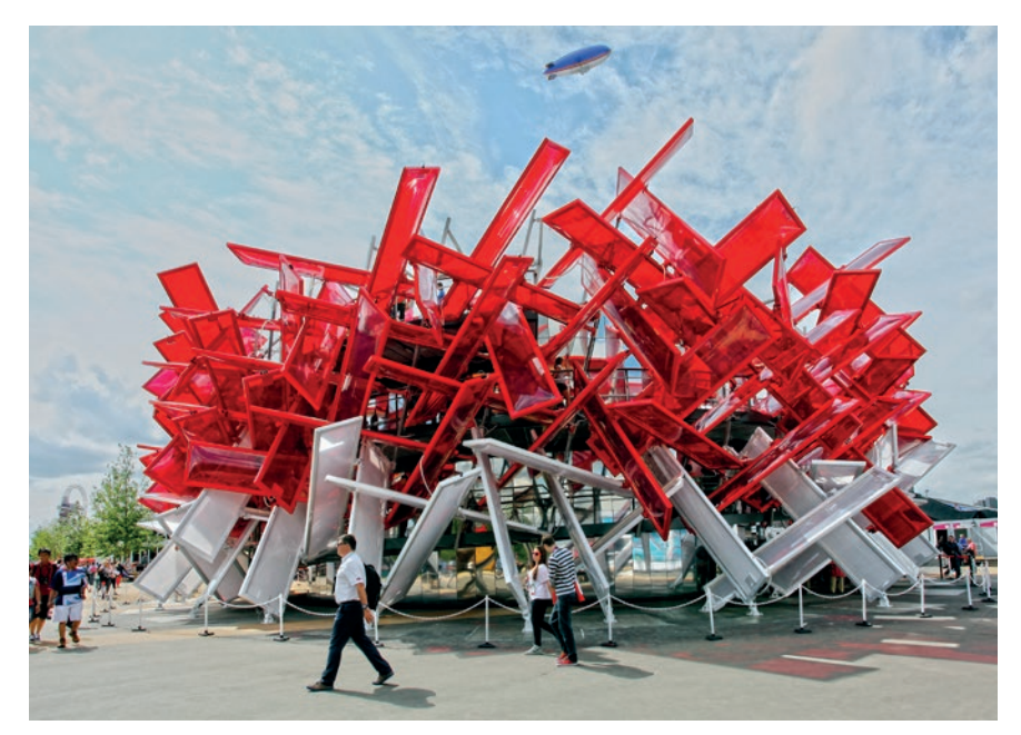
Coca Cola"Beatbox", Summer Olympics, London