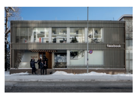
Facebook Pavilion, Davos