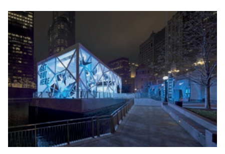
Nike Floating Gym, Chicago