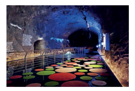
Sasso San Gottardo themed exhibition, Gotthard