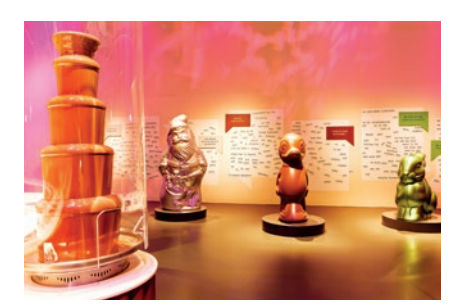
Chocolat Frey Visitor Center, Buchs