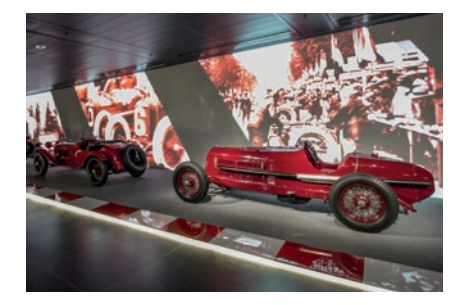
Alfa Romeo Museum, Arese

Quality consciousness, on-time completion, and the efficient use of materials are standard procedure with NUSSLI. Our own production facilities for carpentry, timber, and metal construction have proven a huge advantage in this respect. They are helpful to us in planning the construction of test structures and developing special solutions, as well as ensuring quality-conscious implementation.