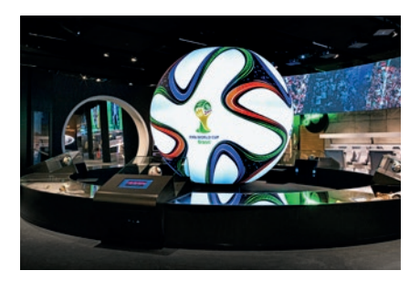
German Football Museum, Dortmund