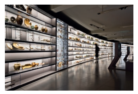
State Museum of Archaeology, Chemnitz