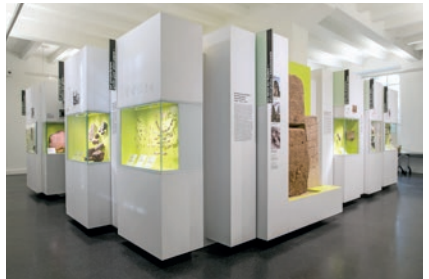
Hessian State Museum, Kassel