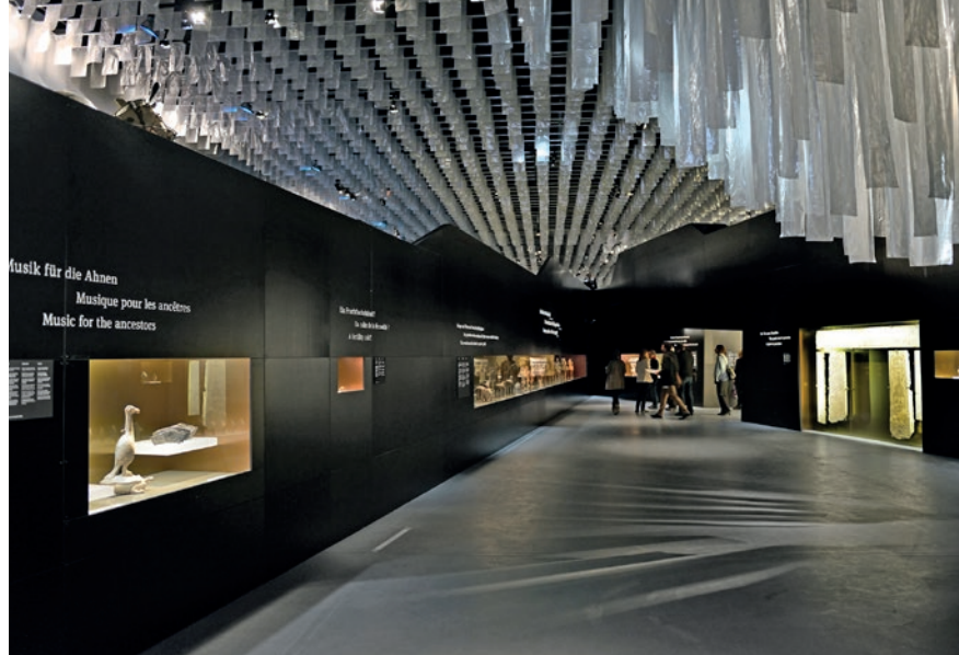
Qin Exhibition, Bern Historical Museum