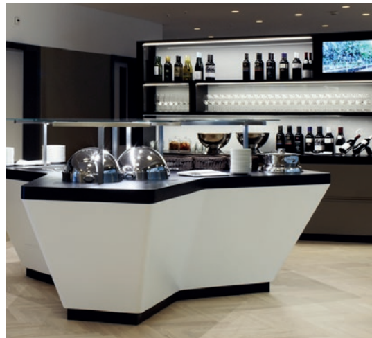
Interior fittings with buffet installations