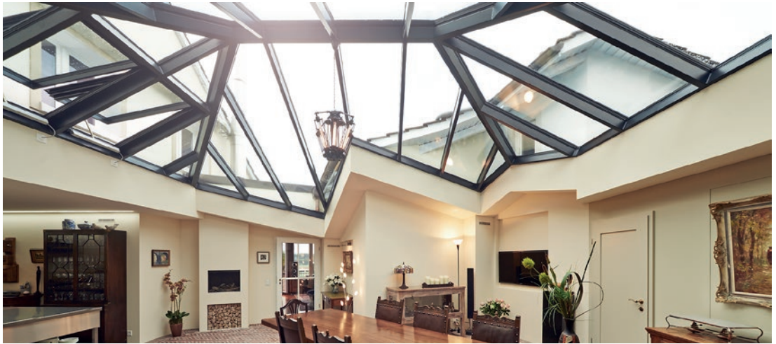
Corner bathroom furnishings made of sheet steel and a thermally insulated steel and glass roofing structure