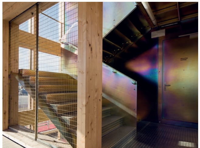
Staircase structure with integrated railing