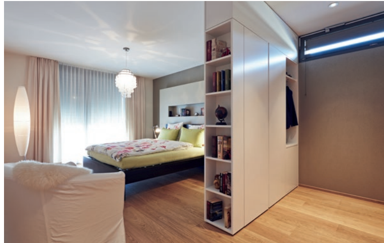
Bedroom with bed, partition and dressing area