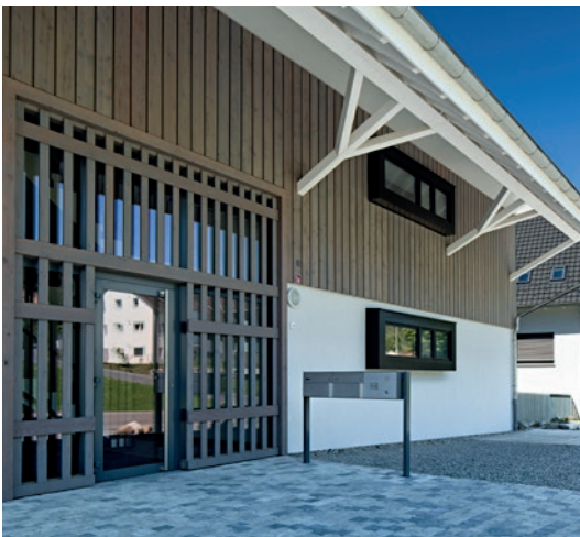
Conversion – facade, roof construction, skylights, dormers and interior fittings