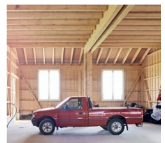
Hall construction including facade, attic, stairs and windows