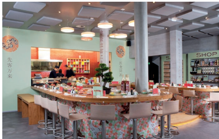
Sushi bar with conveyor