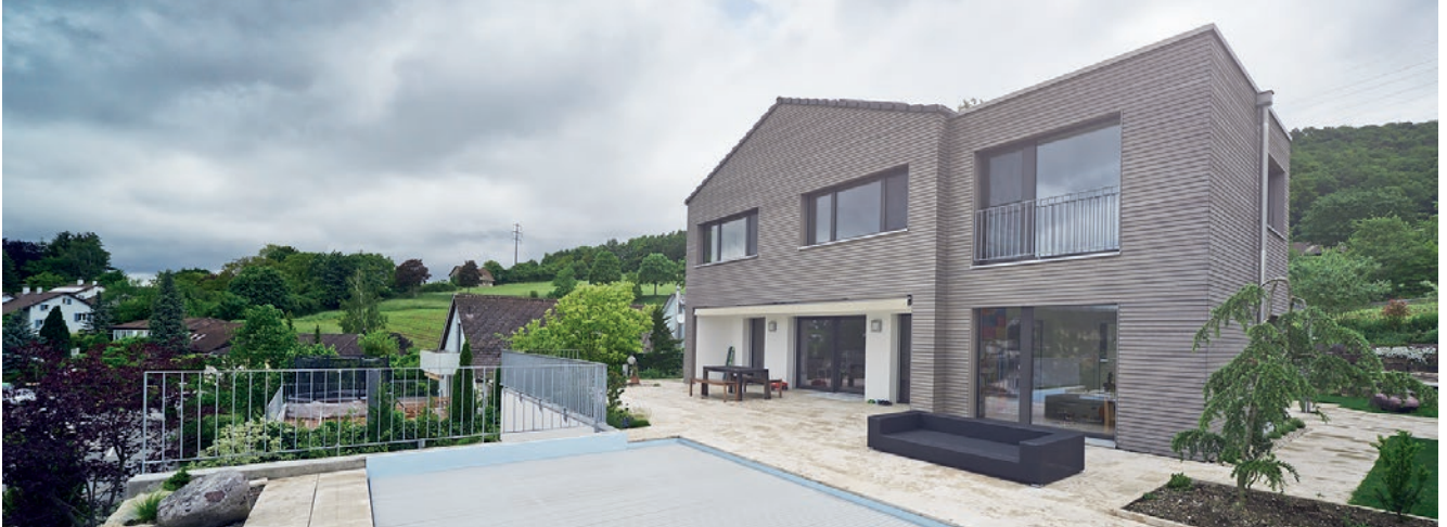
Conversion – facade, element construction and pitched roof

Innovative, creative and always trendy: Wood is a material that meets the highest standards. The name NUSSLI has been closely associated with it since our founding as a carpentry workshop in Hüttwilen in 1941. Our workshop is the source of unique and exclusive wooden structures. Our large production hall gives us scope for construction projects on any scale – for example, when enormous spans, airy structures or ingenious statics are needed.