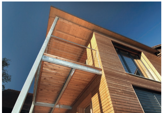
Balcony structure made of steel and glass