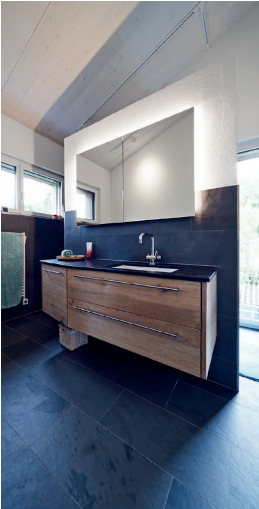
Bathroom with vanity

When state-of-the-art machinery, outstanding knowhow and Swiss quality consciousness come together, the result can only be something very special. Our employees are constantly exploring the potential of wood as a material. While focusing on your vision, our experts realize exclusive, customized architectural and interior design concepts with atmosphere.