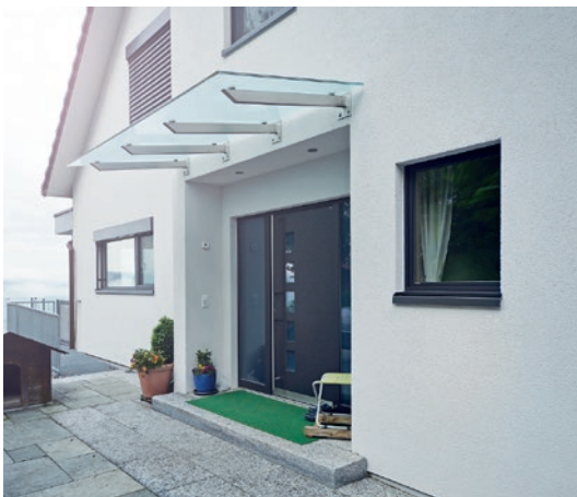
Steel canopy structure and thermally insulated hot-dip galvanized entrance door