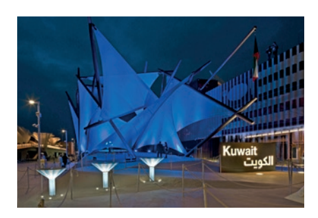
Architectural masterpieces for the perfect presentation of your brand