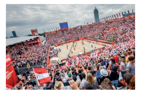
FIVB Beach Volleyball Championship, Vienna