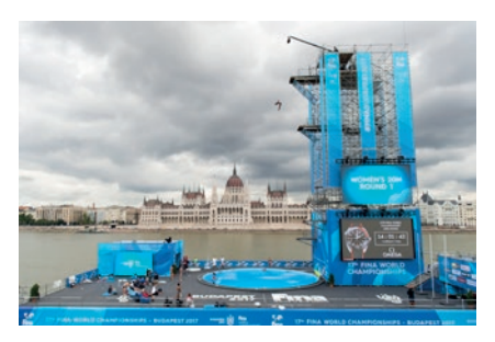
FINA High Diving World Cup, Budapest