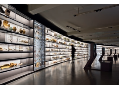
State Museum of Archaeology, Chemnitz