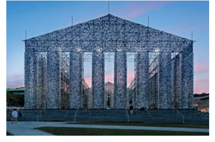
"The Parthenon of Books" documenta 14, Kassel