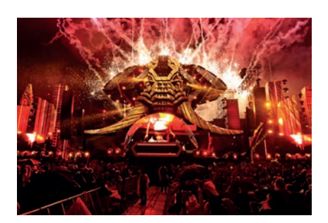
Electric Zoo Festival, New York