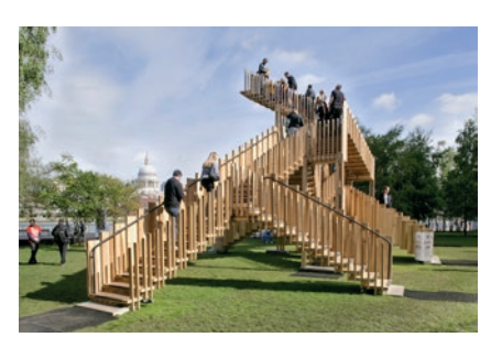
In-house production facilities for wood and metal construction