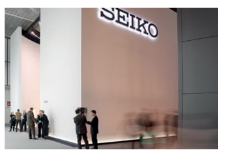
Spectacular trade fair booths for impact in the presentation of brands and products