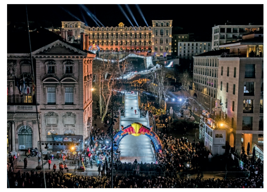
Red Bull Crashed Ice, Marseilles