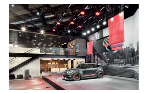
Mini Trade Fair Both, IAA, Frankfurt

Each year, NUSSLI builds approximately 2,000 temporary structures that meet the highest standards where quality, safety and cost-efficiency are concerned. We also present projects that are trendsetting in terms of sustainability, creativity and complexity.