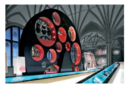
Exclusive structures for permanent or temporary exhibitions