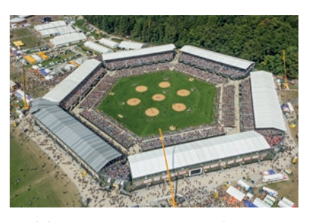
Modular construction on every scale, quickly built, safe, and spectacular